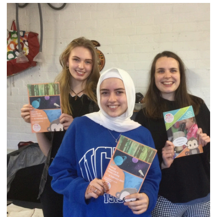
Confetti students with their magazines

The magazine is produced using content created by local researchers, and is compiled, designed and illustrated by graphic design students from Confetti Institute of Creative Technologies. We also work with year 7 pupils from The Wells Academy to copy-edit articles, give feedback and ensure the content and language is right for the target audience.